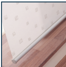
PLAIN PANEL GLIDE

Configure your panel glide to stack on one side or open from the centre. Whatever works for you, we'll custom make it accordingly.